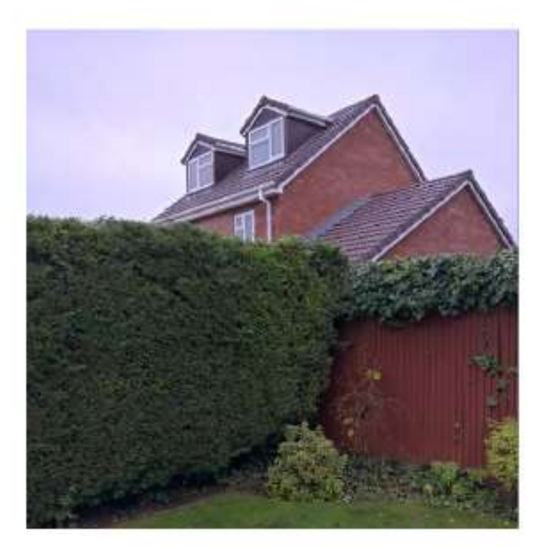
Rear of 20 Dellow Grove