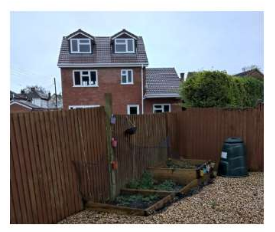
Front of 19 Dellow Grove